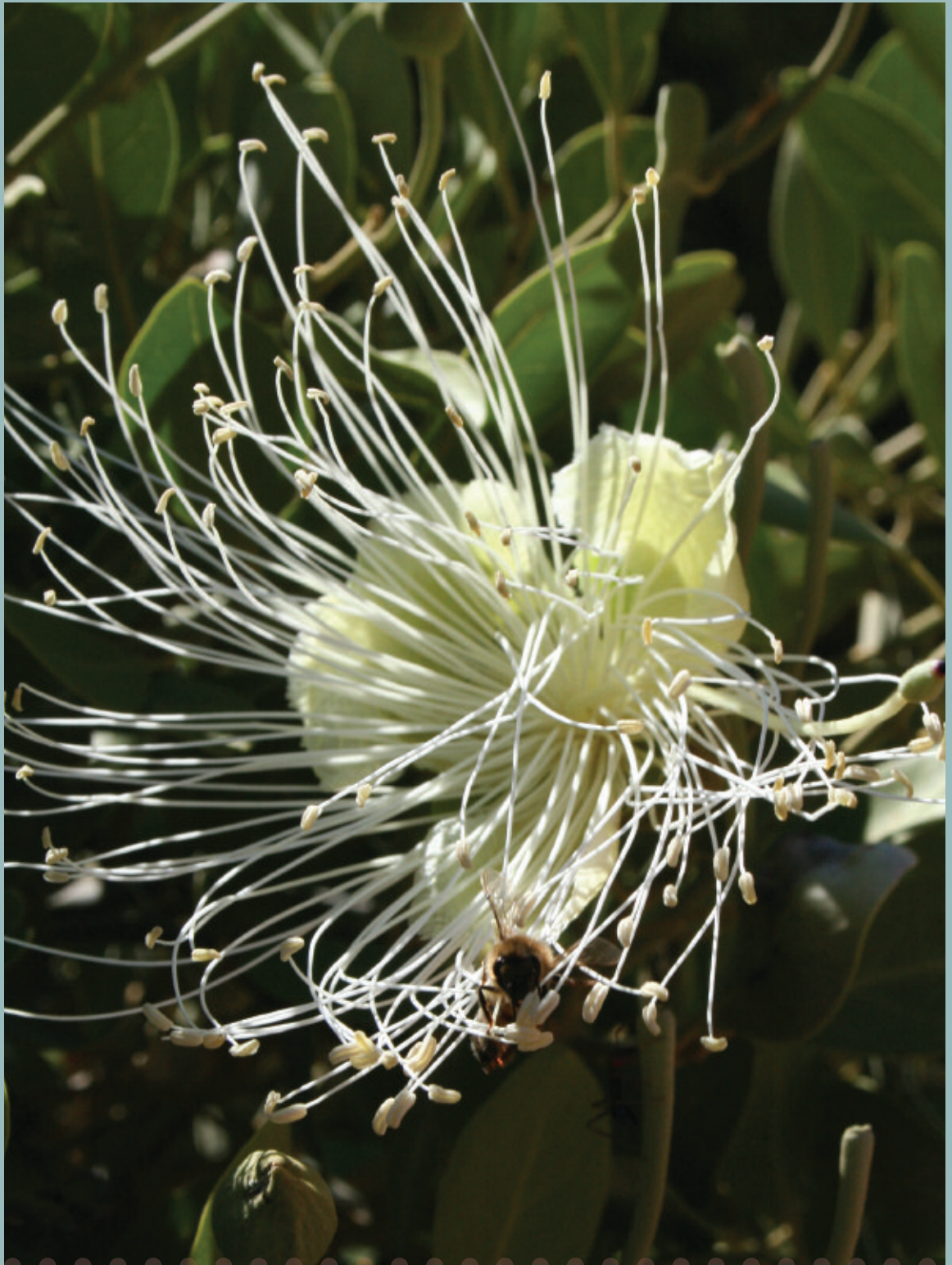
Iga Flower.

IGA WARTA, LOCATED IN THE NORTHERN FLINDERS RANGES, SOUTH AUSTRALIA PROVIDES A UNIQUE "ONCE IN A LIFETIME" EXPERIENCE. THE CULTURAL AWARENESS PROGRAM INCLUDES ALL MEALS, ACCOMMODATION, TOURS AND TRANSPORT TO EACH AREA OF TEACHING.